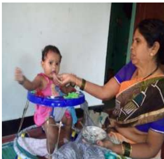
Fig.- 1 Child care

In the activity cash earning outside the home, the selected women found to be spending 67 minutes. As regards enterprise, it can be expressed from the table that the respondents spent 46 minutes. After working for 4-5 hours a day for working and non working women, there is need to rest for some time.