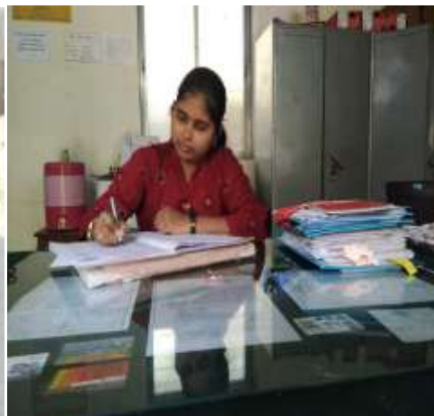
Fig.- 4 Service- office work

This finding of the present study is supporting with the findings of Kulkarni and Murali (1991) and Bellurkar (2014). It is mentioned that the women spend 5-8 hours per day on the farm in peak periods depending on the size of land holding and the type of crops grown.