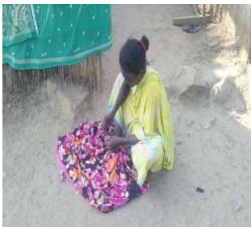
Fig.- 3 Stitching