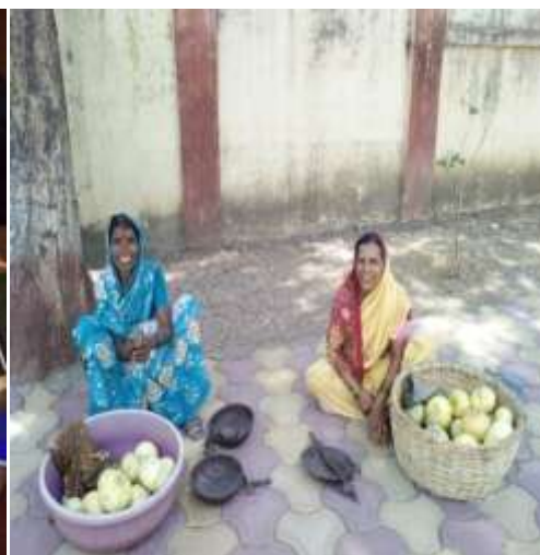
Fig.- 2 Fruits selling

It was observed that the women took mid work rest or they got leisure time as 57 minutes. Working women they got half to one hour interval and again they have to continue their work. But when they are at home and they can spend more time on their rest.